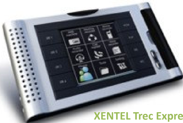
XENTEL Trec Exprez